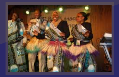
The cultural night showed Africa's diversity in abundance