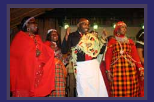
Kenayns showing off their cultural attire popularly known for the Masai tribe