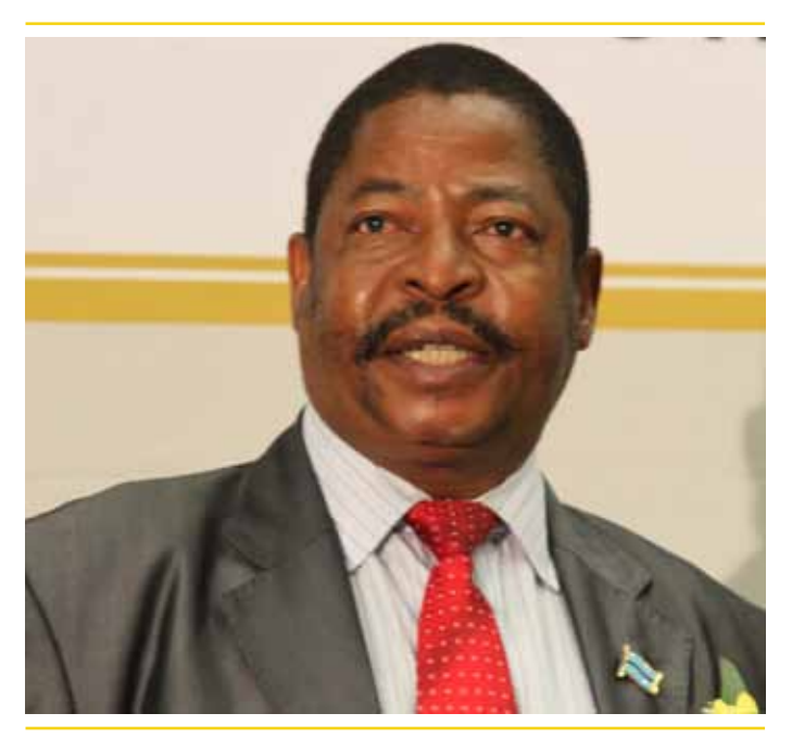
Honourable Keletso Rakhudu

ormer Assistant Minister of Education and Skills Development Honourable Keletso Rakhudu has pointed out that Education is a critical factor to the success and sustainability of African Economies and that, while education is a primary tool for economic enhancement, quality in education is even more important.