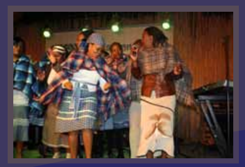
It was a night to remember for these Botswana Conference delegates during the cultural night