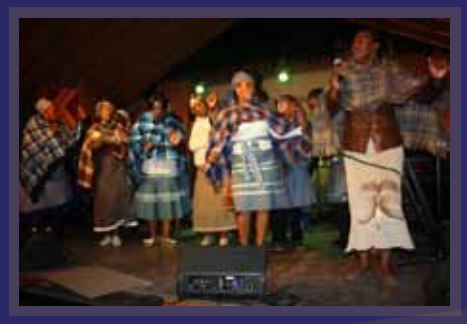
Botswana delegates during the conference cultural night at Botswana craft